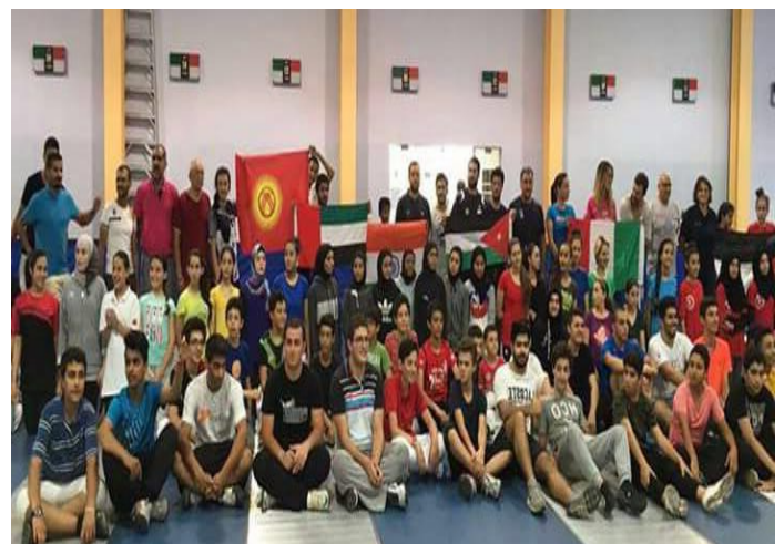
Figure 1 Second International Training Camp