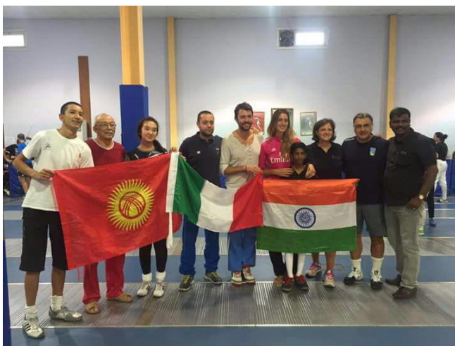
Figure 2 Second International Training Camp